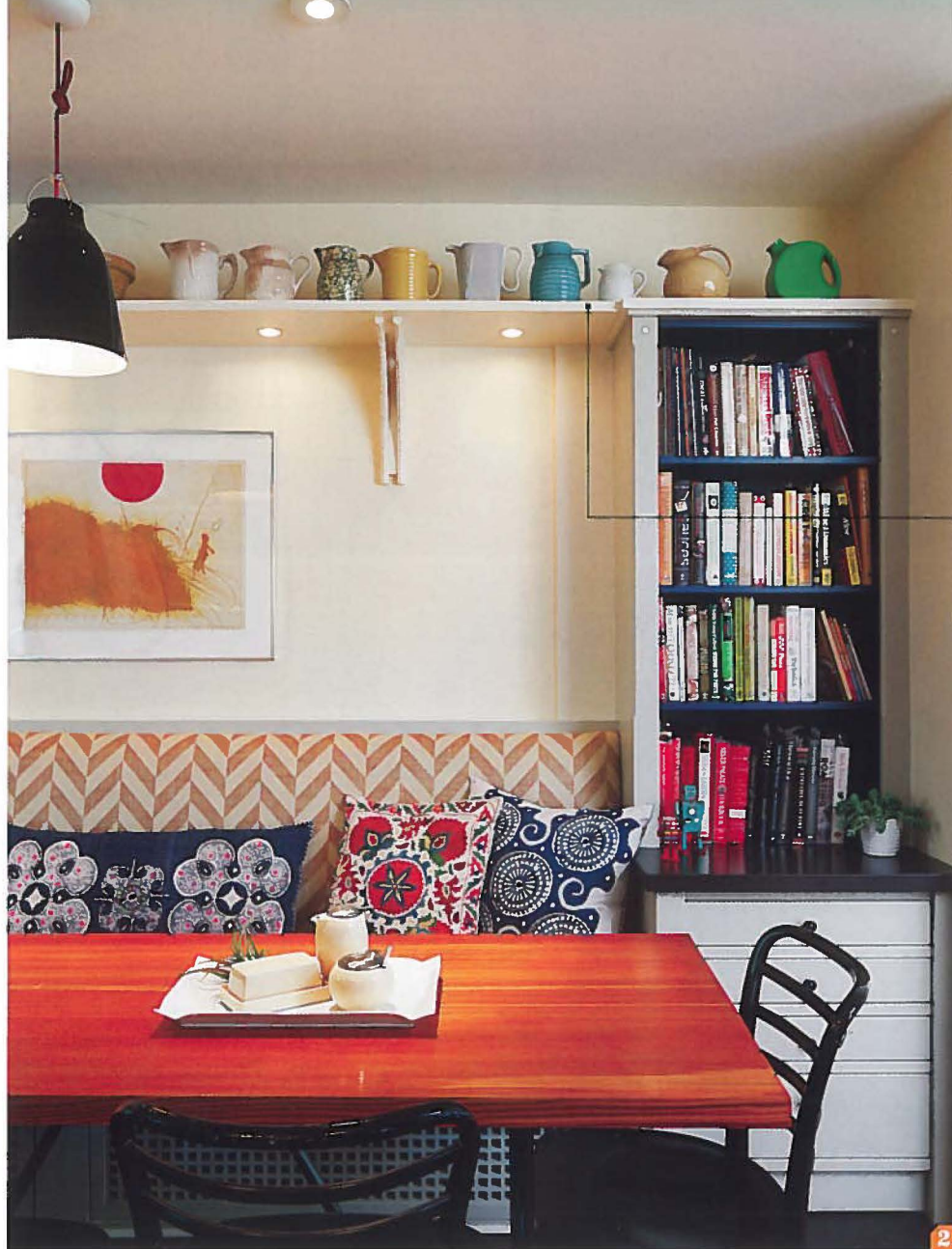
A wraparound shelf showcases the owner's pottery collection and unifies the room.